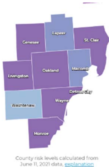
Table 1-3 (Updated as of 07-2-2021)